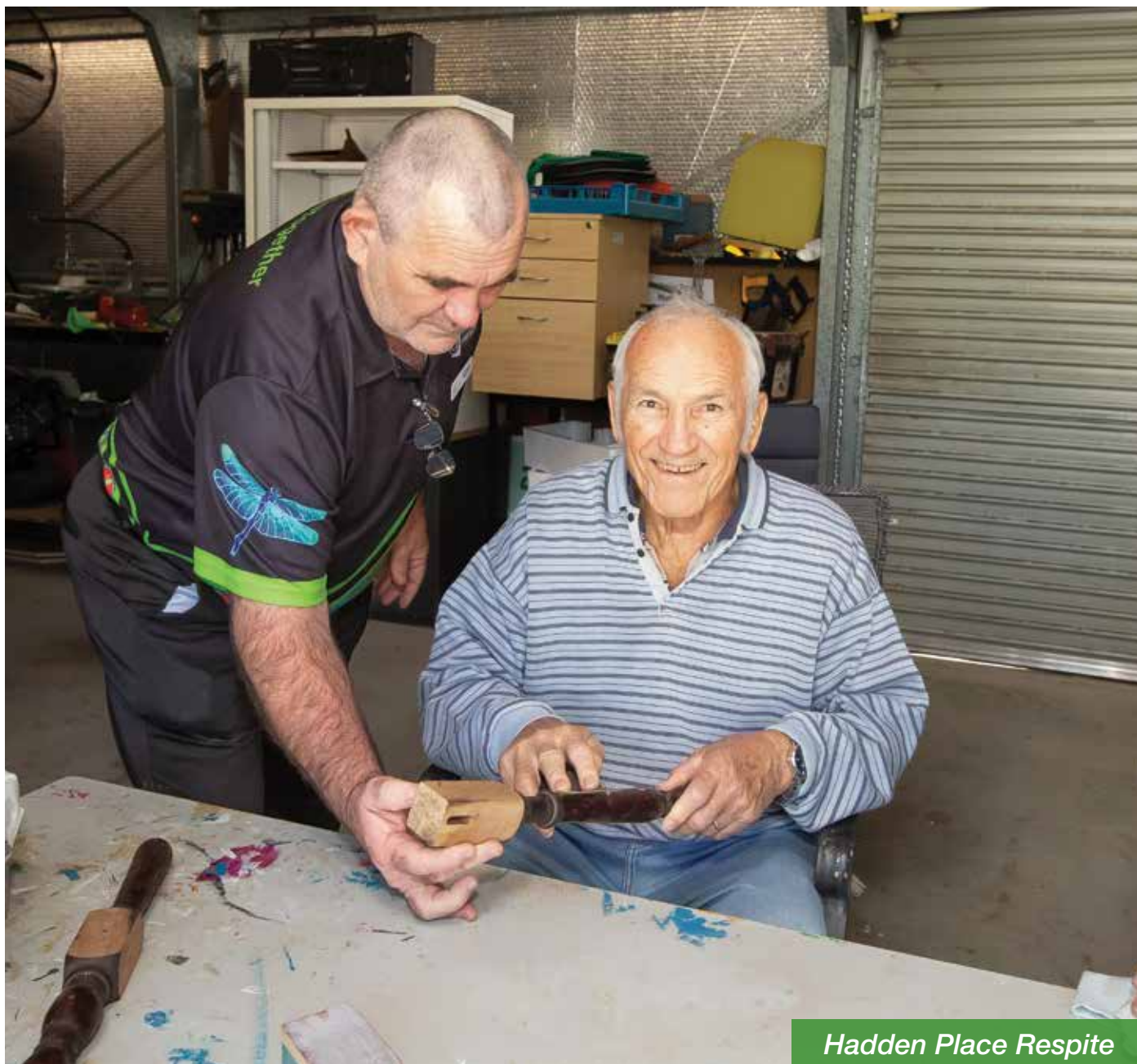
Hadden Place Respite