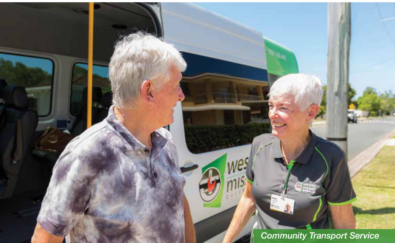
Community Transport Service

If you feel you are being harassed or bullied or you witness this happening, you are encouraged to report this to your workplace supervisor or local manager as soon as possible. The full policy can be found on the intranet.