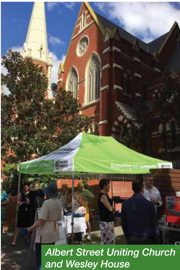
Albert Street Uniting Church and Wesley House

As a general rule (unless negotiated with the local manager and officially documented through Volunteer Relations), volunteers who are approved to drive their own private vehicle while in their role are not permitted to transport customers or residents in these vehicles.